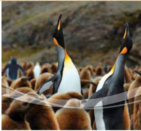
South Georgia King Penguins