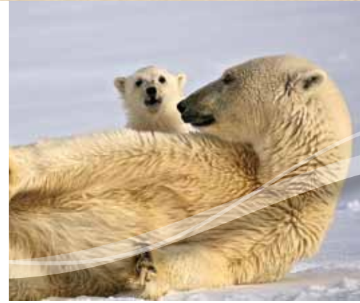
Spitsbergen – Kingdom of the Polar Bear