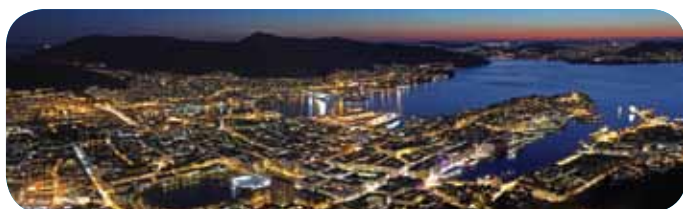
Bergen Panorama at night