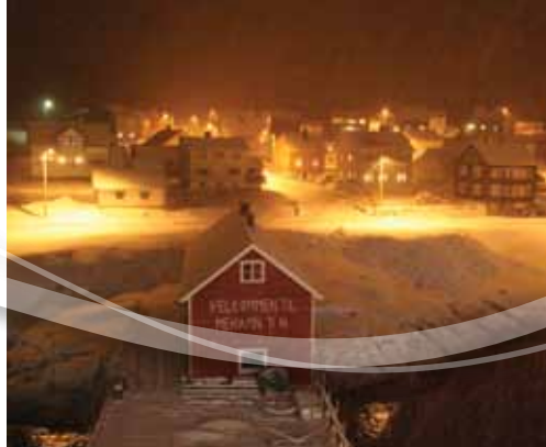
Mehamn in winter light