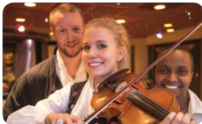
Edvard Grieg's classical music comes alive in Norway