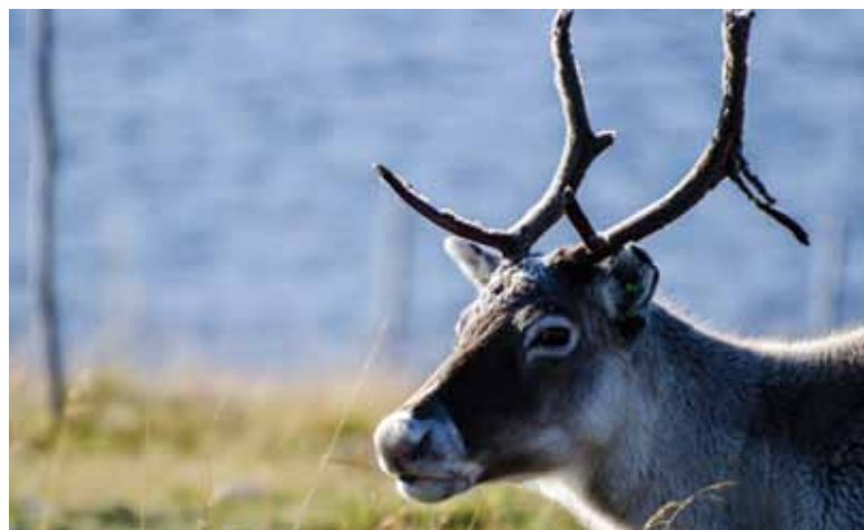
North Cape – Reindeer

Winter – Is your time for adventure and Norway is an adventure capital. The days are shorter which gives Mother Nature more time for an impromptu dance of Northern Lights high above, and it's the time of year when you can take the reins of a dog sled team and head out into the wilderness or drive your first snowmobile after catching King Crab for dinner in a Viking chief's house. Norway becomes a white, winter wonderland...why not spend Christmas or New Year's here?