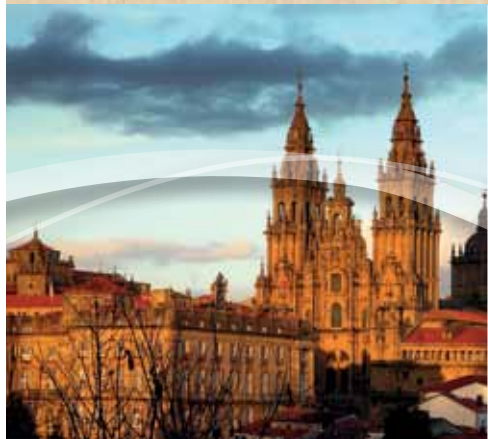
Santiago de Compostela, Spain

You may wonder just how MS Fram gets from one end of our planet to the other! It's easy, she sails between both Poles in the spring and autumn with several special European expeditions that open to you the fascinating lands of Norway's southern Fjordland region, British Isles, Germany, France, Spain, Portugal and two voyages that introduce you to wondrous isles of the Atlantic Ocean, or the ultimate Trans-Atlantic crossing between Europe and South America!