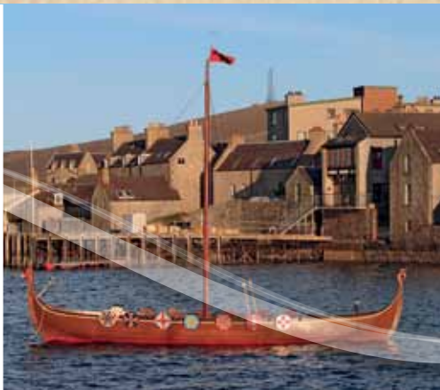
Lerwick, Shetland Islands