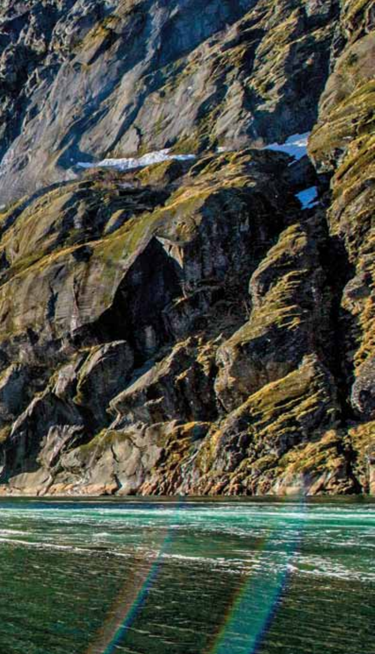
MS Finnmarken enters magnificent Trollfjord