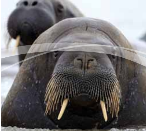
The Walrus – easily recognised by its tusks

Discover the World Cruising and Hurtigruten offer you more than simply Norway and Scandinavia...we also offer you the remotest corners of our planet. During the Northern summer, Hurtigruten's state of the art expedition ship, MS Fram, calls the Arctic home, with adventures that will take you to Greenland, Spitsbergen and Iceland. Fascinating Inuit culture, wild and dramatic scenery, unusual wildlife and birdlife, and a great expedition team await your arrival.