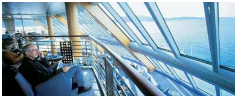
Panorama Lounge – MS Trollfjord

Hurtigruten's rich maritime history and unequalled knowledge of this region ensures that you'll get so close to the real Norway you'll feel as though you've become a part of each port you visit.