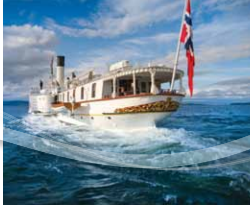
Skibladner Paddle Steamer