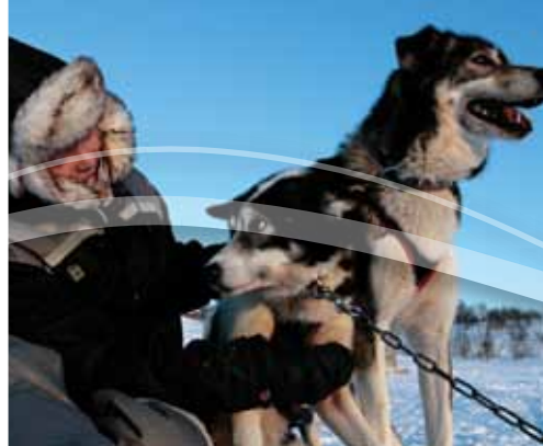
Your dog sled team