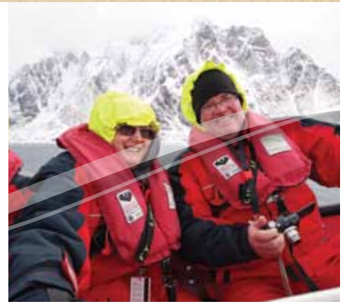
Become acquainted with nature's grandeur