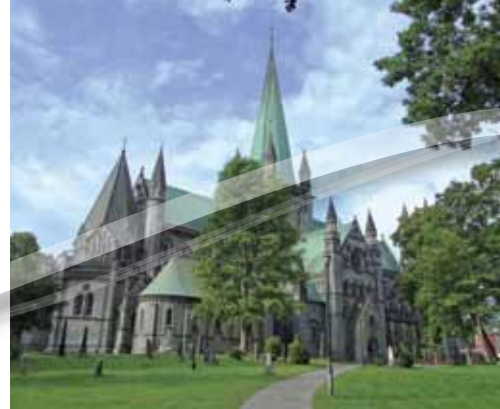
Trondheim – Nidaros Cathedral