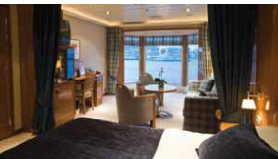
The Suite Life