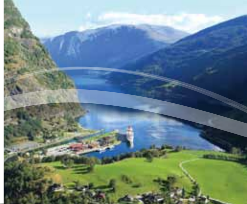
Flåm and beautiful Aurlandsfjord