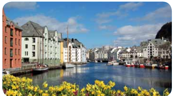
Art Nouveau Ålesund

We have mountain biking, high-powered fjord boat safari, and wild white water rafting options!