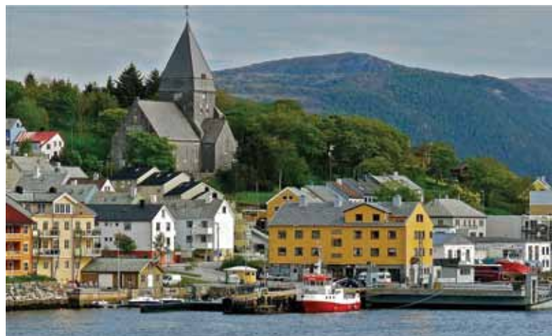
Kristiansund, Top of Fjord Norway and gateway to the Atlantic Road

Wildlife often makes an appearance in Norway where you may spot otters, badgers, moose, reindeer, and mighty humpback and sperm whales. Look towards the sky and be dazzled by hundreds of bird species including the soaring Sea Eagle. In May every year, millions of migrating birds return to the Arctic coast for breeding and nesting, at which time you're likely to see puffins, kittiwakes, guillemots, razorbills, cormorants, Arctic Skuas and Northern Gannets.