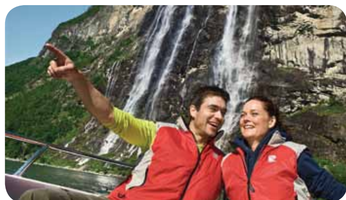
NSB / The Bergen Railway / Photo: Rolf M. Sørensen

Upgrade your hotels in Oslo and Bergen. It's easy. Ask Us.