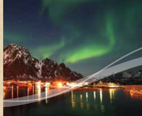
Aurora Borealis over Lofoten